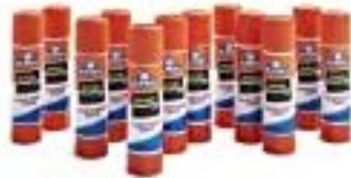
Washable Glue Sticks 12 Count