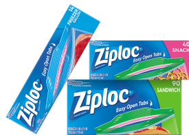
Gallon and Sandwich Size 1 of each size