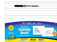
Dry Erase Lap Board w/Marker, 9" X 12" Double Sided Whiteboard Primary Ruled Lined & Blank